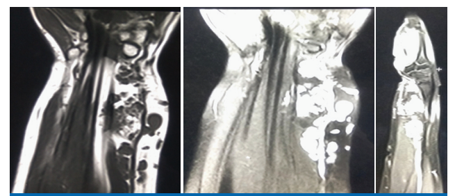
[Table/Fig-4a-c]: Vascular malformation. Irregular T1 hypointense (a) T2 hyperintense; (b) lesion which shows enhancement; (c) post contrast administration noted in the muscular plane of flexor compartment of distal forearm.

GCTTS show characteristic low signal on T1W and T2W images with enhancement post contrast administration [10]. In present study, 3 cases were studied [Table/Fig-5a-c].