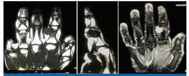
[Table/Fig-5a-c]: GCTTS. A well-defined T1 iso-hypointense (a), T2 hypointense lesion; (b) Showing heterogenous enhancement on contrast administration; (c) Noted in medi-volar aspect of proximal phalanx of right second digit, adjacent to flexor tendon.

Assessment of palpable lesions of hand and wrist is important in deciding further management. The need for further